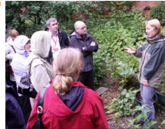
Get involved with organising community events or projects that cover a range of topics

Neighbourhood Action Teams – We have 8 teams across Burnley and Padiham. Take part in a monthly estate inspection or get involved with organising community events. Make new friends and be a part of change for the better.