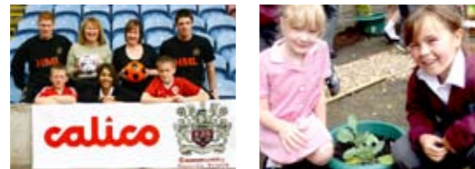
Make new friends and be a part of change for the better.

give us a call on FREEPHONE 0800 169 2407 ; or return the attached form to us, (either by post or by handing in to our staff); or complete the form online at www.calicohousing.co.uk/getinvolved